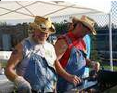
Team Rine-O at the grill during the festival.

Lots of delicious hot wings, great music, good beer, cool aircraft and lots of friends and neighbors—a great mix at Hot Wings Over Coshocton, a collaborative fundraising event for the museum and the Coshocton County Airport. We heard heaps of praise about the event and hope to have it again. Winners of the hot wing contest were Team Rine-O who was awarded People's Choice, Best Classic Hot Wing and Best Gourmet Hot Wing, and Sport Zone who was awarded Best Hot Hot Wing. Congratulations!